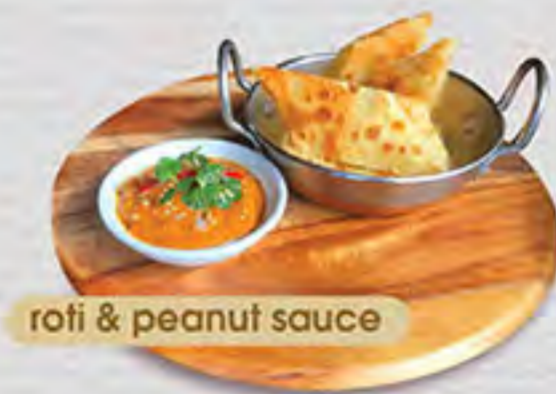
roti & peanut sauce